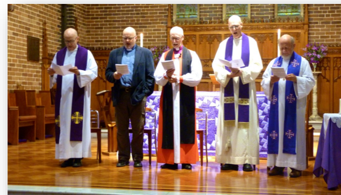
Advent Ecumenical Liturgy held at St Alban's Anglican Church, Epping last Tuesday night.

I believe in one, holy, catholic and apostolic Church. I confess one Baptism for the forgiveness of sins and I look forward to the resurrection of the dead and the life of the world to come. Amen.