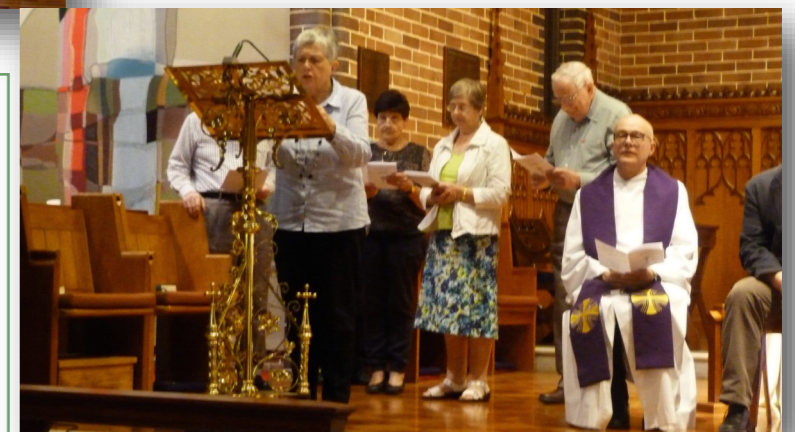
Below: The Prayers, members of each Church community reading their particular prayer.